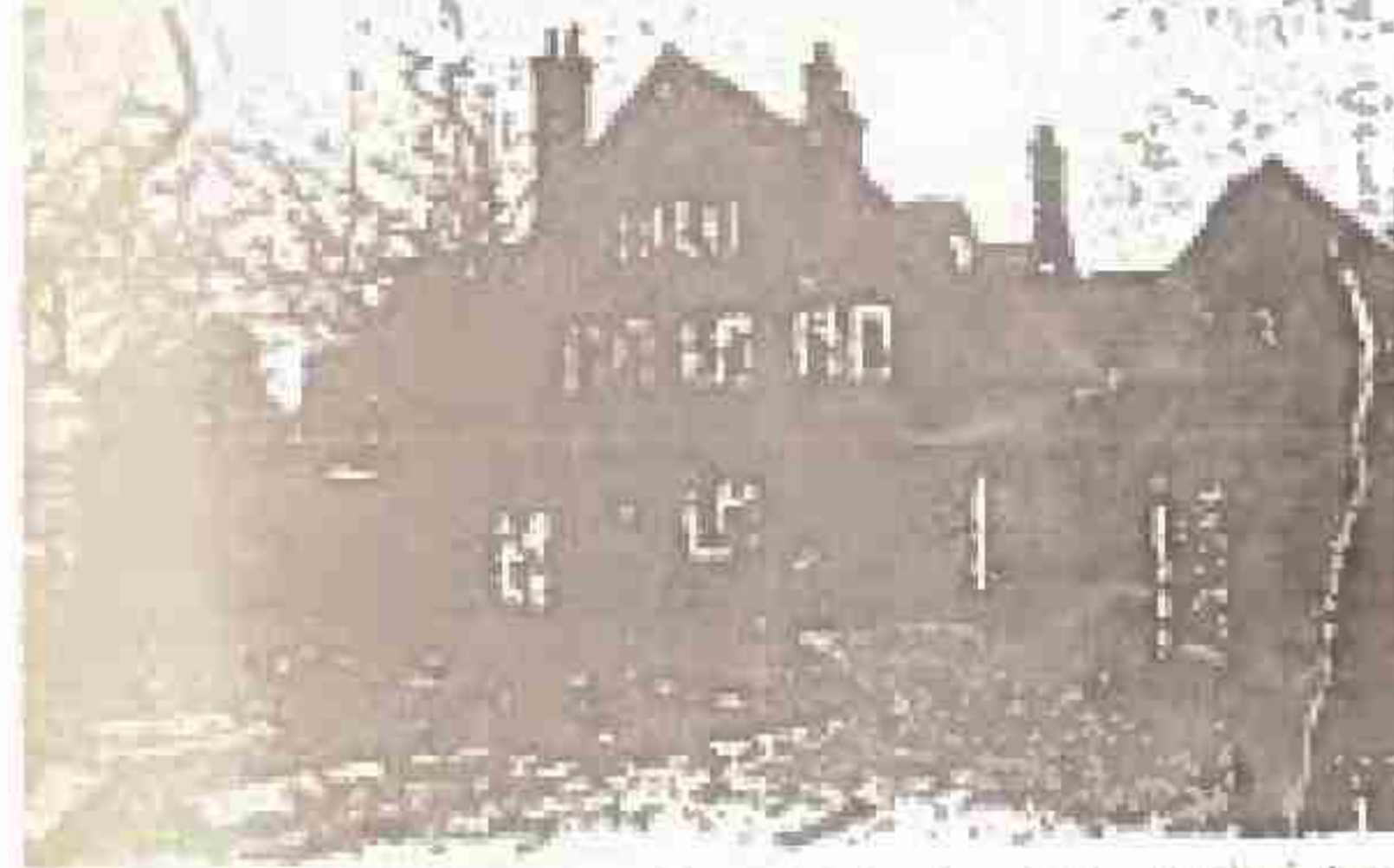
BEECHWOOD: Escaping kids laugh at the law