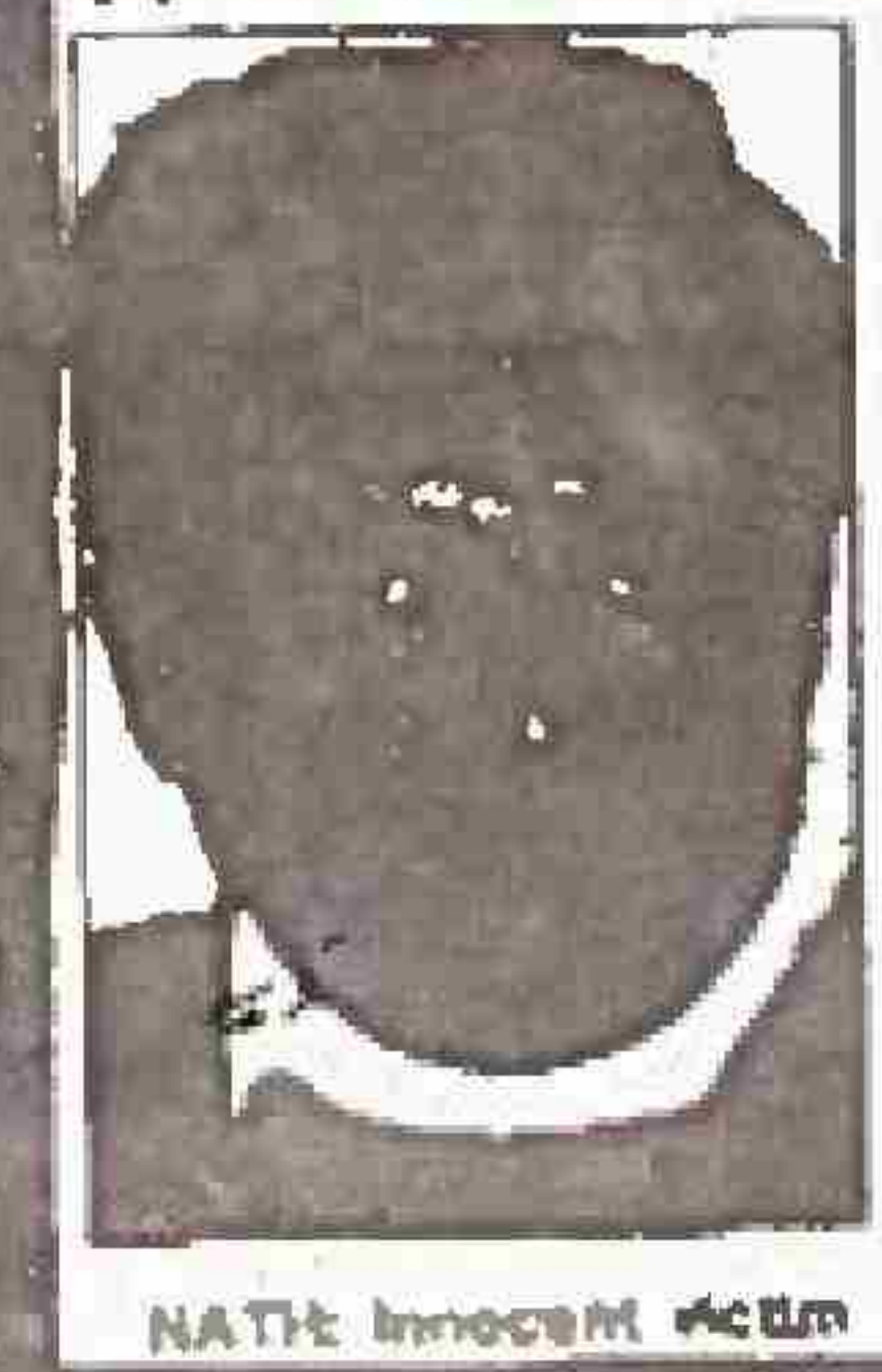
NATH Innocent victim